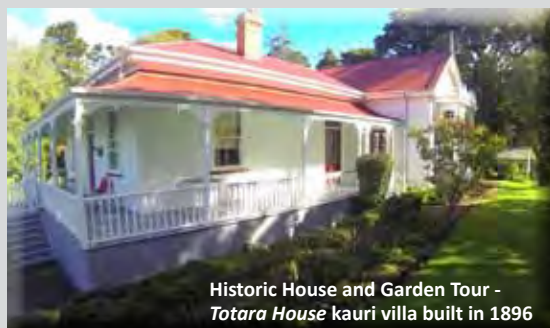
Historic House and Garden Tour - Totara House kauri villa built in 1896