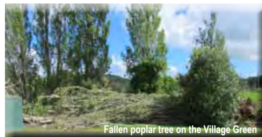
Fallen poplar tree on the Village Green

If you hadn't noticed , one of the poplars on the riverbank fell in a recent storm, narrowly missing the water tank on the Village Green and stripping branches